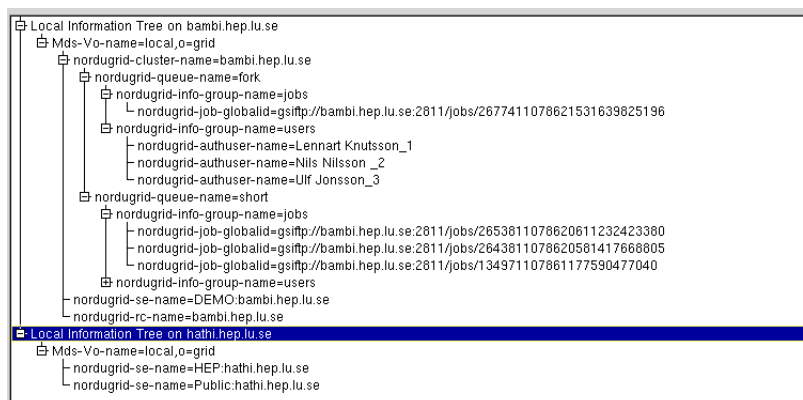
Figure 2: The local information tree on two resources. The first machine bambi.hep.lu.se provides both computing, storage and data indexing services while the second resource hathi.hep.lu.se hosts two storage elements.