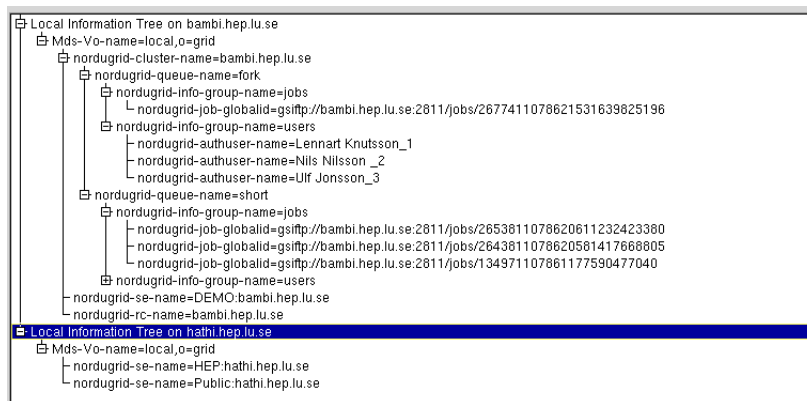
Figure 2: The local information tree on two resources. The first machine bambi.hep.lu.se provides both computing, storage and data indexing services while the second resource hathi.hep.lu.se hosts two storage elements.