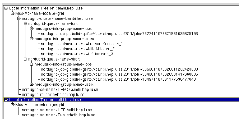
Figure 2: The local information tree on two resources. The first machine bambi.hep.lu.se provides both computing, storage and data indexing services while the second resource hathi.hep.lu.se hosts two storage elements.

Attribute value: {Locally unique VO name} Example: local Related xRSL: none