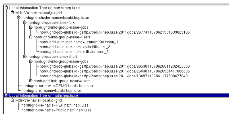
Figure 2: The local information tree on two resources. The first machine bambi.hep.lu.se provides both computing, storage and data indexing services while the second resource hathi.hep.lu.se hosts two storage elements.

Attribute value: {Locally unique VO name} Example: local Related xRSL: none