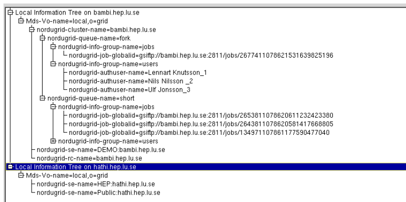
Figure 2: The local information tree on two resources. The first machine bambi.hep.lu.se provides both computing, storage and data indexing services while the second resource hathi.hep.lu.se hosts two storage elements.

Attribute value: {Locally unique VO name} Example: local Related xRSL: none