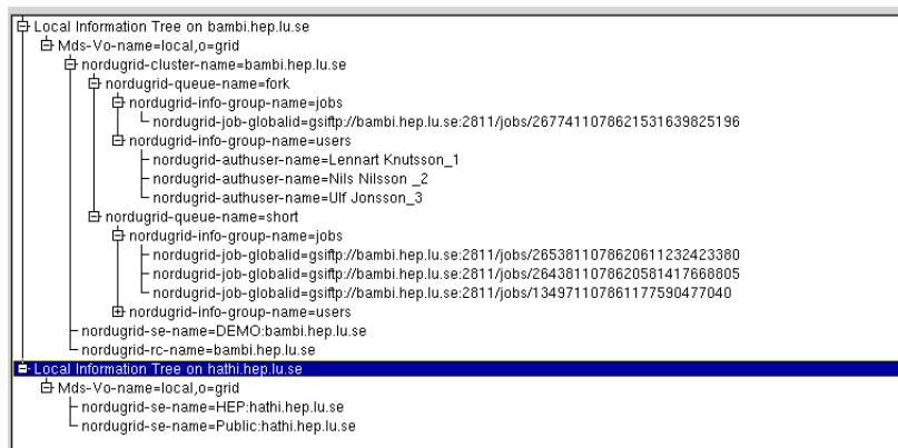
Figure 2: The local information tree on two resources. The first machine bambi.hep.lu.se provides both computing, storage and data indexing services while the second resource hathi.hep.lu.se hosts two storage elements.